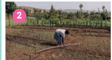
2 During dry periods, pipes are laid to connect the water pan to the onion field