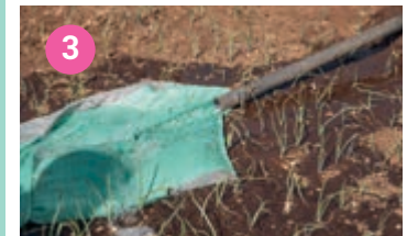
3 At the right time, onion seedlings are watered using this stored water