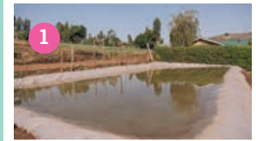
1 Water is collected in a pan, saving it for times of low rainfall